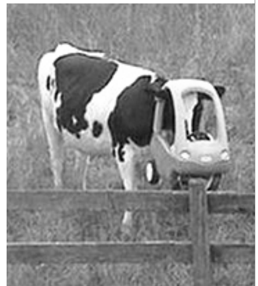
And keep your nose outta' where it don't belong!