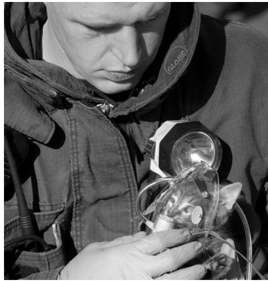
It works if you work it !