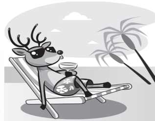
This is the life! Santa thinks I've got the flu.