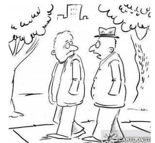
Vegetarian? No way, I'm always eating crow...