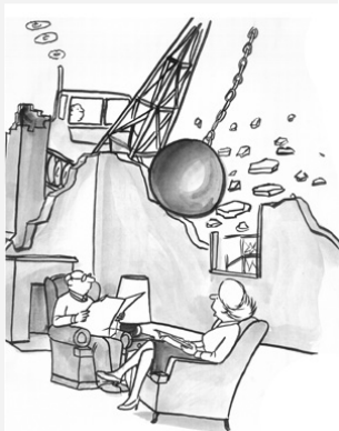
Honey, the wreckage of your past is back.

If you would like to receive the Newsletter via email, then email to farfromitoday@aol.com to submit your request.