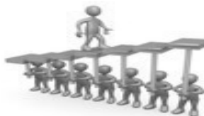
"They need your companionship and your help." Page 111, Big Book, reprinted by permission of A.A.W.S.