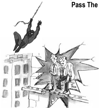
It'd be nice if Spiderman would just sober up once and for all, instead of once in a while...