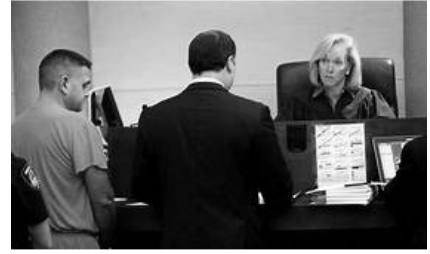
(Note: *'s on page 62 of the Big Book. Used with A.A.W.S. permission).

"Selfishness – self-centeredness!" * "An extreme example of self will run riot. * "We had to quit playing God. It didn't work." *