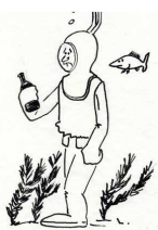
"Geez, I really have hit my bottom!"