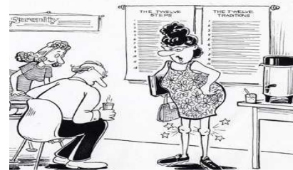
"I hit my knees every morning just like they said."

Reprinted with permission of the A.A. Grapevine.