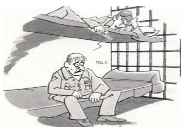
"The good news is, when I get out, I can pick up a 60-day chip."