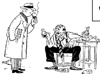
You really ought to give up smoking y'know.