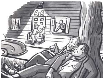
It's about 12 Steps from here, We can make it.